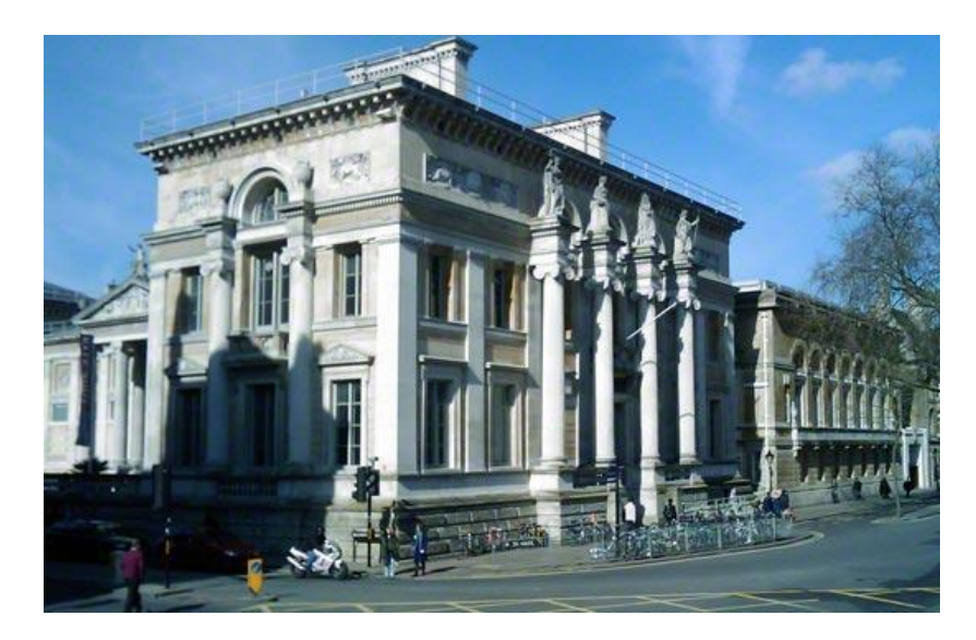
Taylor Institute from the corner of St. Giles' and Beaumont Street.