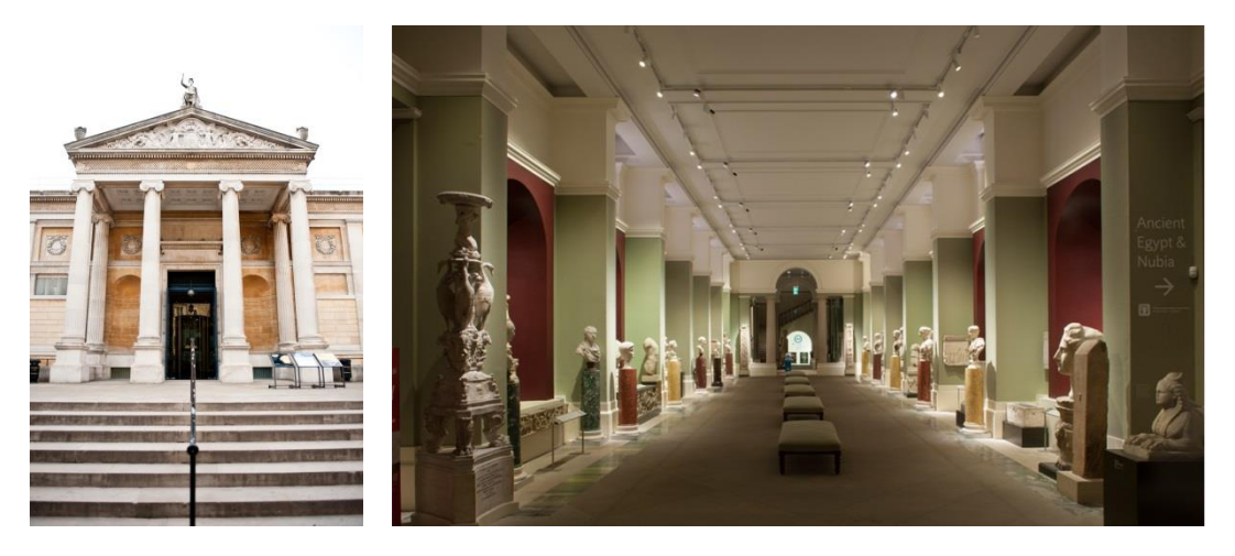
The Ashmolean façade and Randolph Sculpture gallery where dinner will be held.